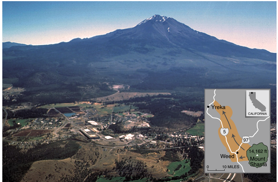
The town of Weed, California, nestled below 14,162-foot-high Mount Shasta, is built on a huge debris avalanche that roared down the slopes of this volcano about 300,000 years ago. This ancient landslide (brown on inset map; arrows indicate flow directions) traveled more than 30 miles from the volcano's peak, inundating an area of about 260 square miles. The upper part of Mount Shasta volcano (above 6,000 feet) is shown in dark green on the map.

A landslide or debris avalanche is a rapid downhill movement of rocky material, snow, and (or) ice. Volcano landslides range in size from small movements of loose debris on the surface of a volcano to massive collapses