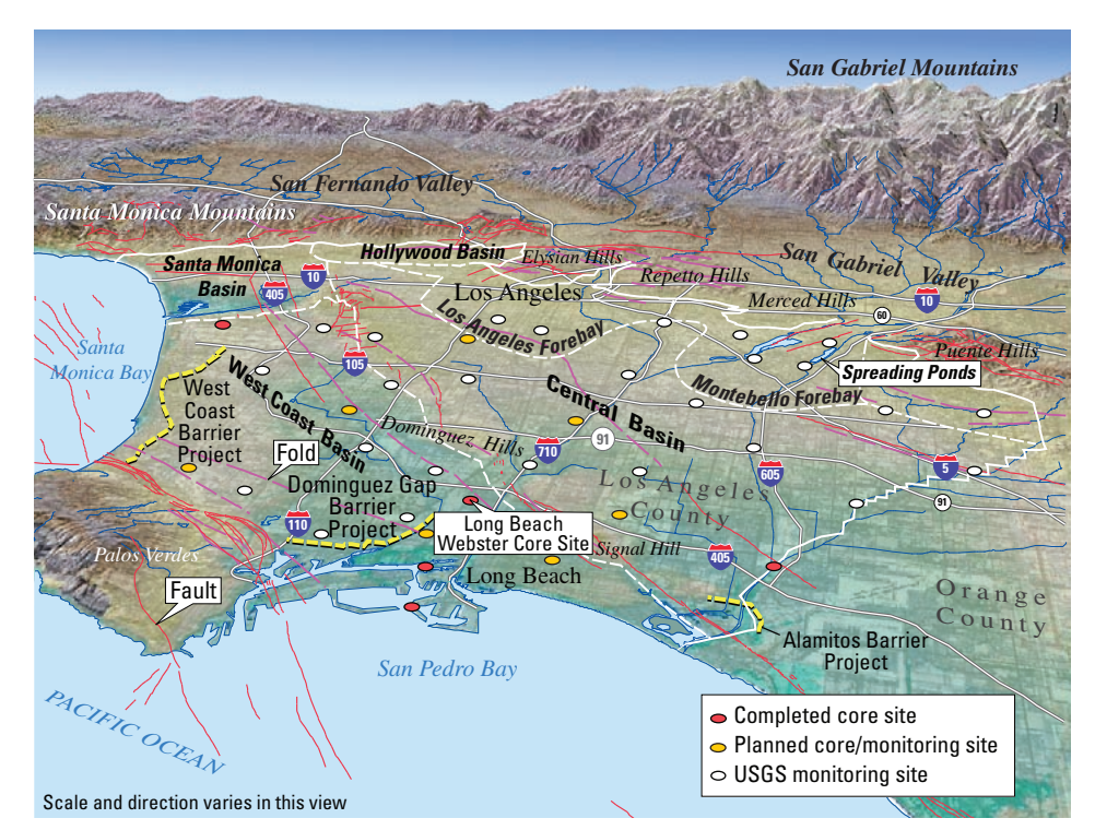
Greater Los Angeles depends on ground water for much of its water supply. As part of a cooperative project with local water-management agencies to better understand the ground-water system and geology of the Los Angeles Basin, the U.S. Geological Survey has drilled more than 30 monitoring wells. Critical issues being examined include the transport and fate of recharge water infiltrated into the ground-water system from spreading ponds in the Montebello Forebay (an area where surface water easily infiltrates the ground) and saltwater intrusion into freshwater aquifers along the coast. In an effort to halt saltwater intrusion, barriers (yellow lines) consisting of arrays of freshwater injection wells have been installed by local water-management agencies.

The USGS has already drilled more than 30 monitoring wells throughout the Los