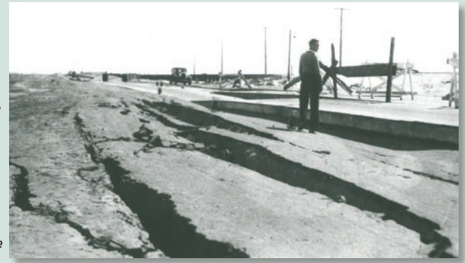
Data being obtained by the U.S. Geological Survey on the distribution and character of near-surface sediments in the basin are providing information that is crucial to evaluating local susceptibility to earthquake damage caused by liquefaction and other forms of ground failure.

During earthquakes, ground shaking may cause water-saturated sediment to "liquefy," resulting in ground failure. In the 1933 Long Beach earthquake, liquefaction of the underlying soil damaged this section of the Pacific coast highway south of Los Angeles. In the 1994 Northridge earthquake, liquefaction also caused considerable damage in the Los Angeles Basin.