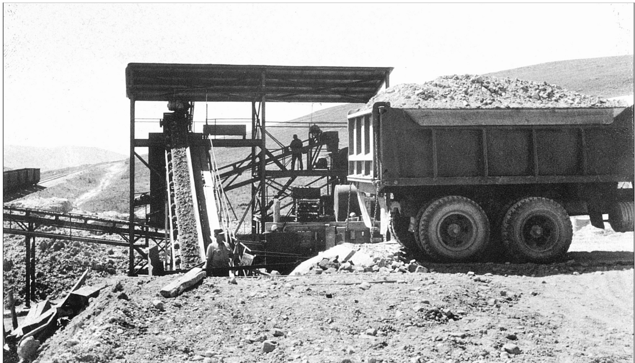
Figure 126. Loading Centennial Mine phosphate ore at Monida, Montana, September 23, 1957.