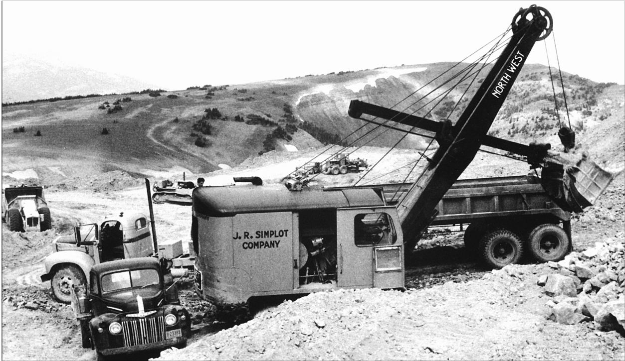
Figure 125. Centennial Mine, September 23, 1957.