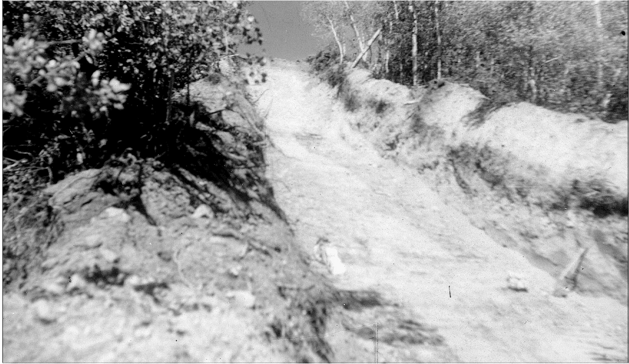
Figure 183. Exploration Trench “E”, Champ Mine, date unknown.

The Conda Partnership initiated mining operations on Federal lease I-04979 in late September, 1982, with a small, limited production through the remainder of that year and into 1983. The initial mine plan called for two open pits on the lease. Equipment used in the opening of the mine were diesel-powered scrapers to remove the overburden and front end loaders to remove the ore. Ore was loaded onto trucks and transported six miles via a private haul road to the rail head loading tippie at the Maybe Canyon Mine where the ore was loaded into rail cars and shipped to the Conda Partnership plant at Conda, Idaho.