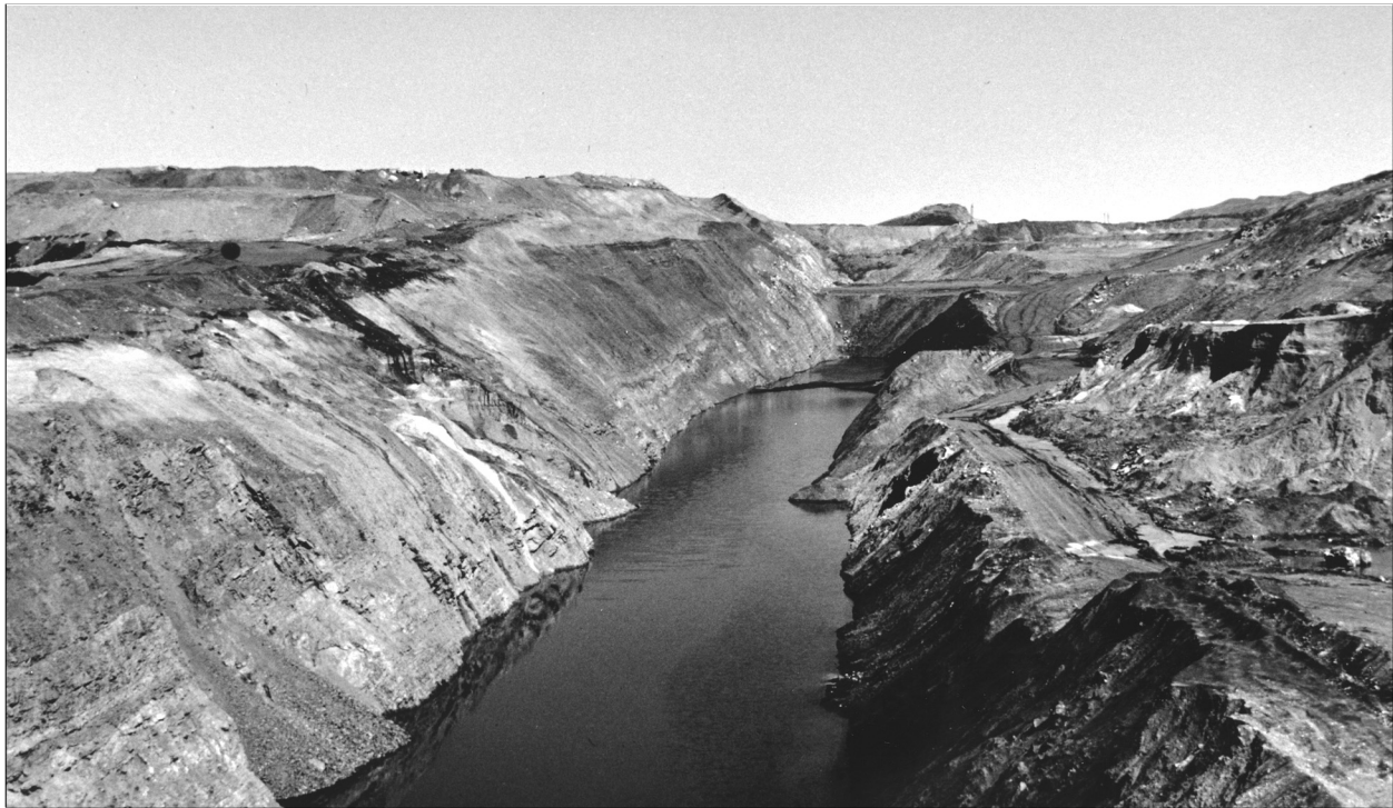
Figure 184. Champ Mine, view north, June 11, 1986.

By later in 1985, all recoverable phosphate reserves on the Champ Mine Extension, I-19602, had been mined. Backfilling of the pits with overburden and waste had been taking place continuously during the mining phase, and with the completion of mining operations, final reclamation was initiated. The final reclamation consisted of completion of pit back filling, overburden replacement, contouring and reseeded, and was completed in 1986 (Figure 184).